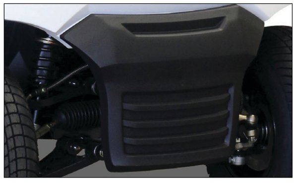
AVAILABLE IN A RANGE OF METALLIC COLOURS